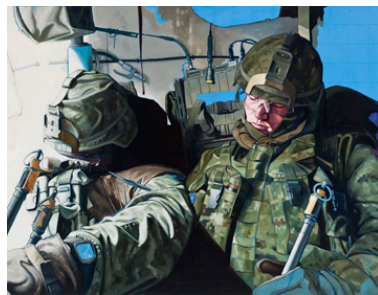
"Sleeping in the LAV" by Scott Waters