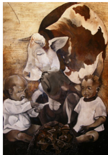
"Small Arms" by Allison Billings Acrylic, 2008

We are asking 10 to 12 potters to make 10 soup bowls each, that will be sold with a bowl of soup at our opening reception for $20 each. These bowls should be the size of a soup bowl or should hold approximately 300 to 350ml with some room to spare at the top of the bowl, glazed and food safe. All bottoms or foot rungs should be smooth to the touch. Participating potters will receive a tax credit of $150 and entry into the Winter's Gift show (a $50 value) OR a $150 tax receipt should they not wish to enter the show. Deadline to RSVP is October 16 . Please contact the administrator at 705-445-3430 for more information. The opening reception for Winter's Gift will be December 4, 5 to 7 pm.